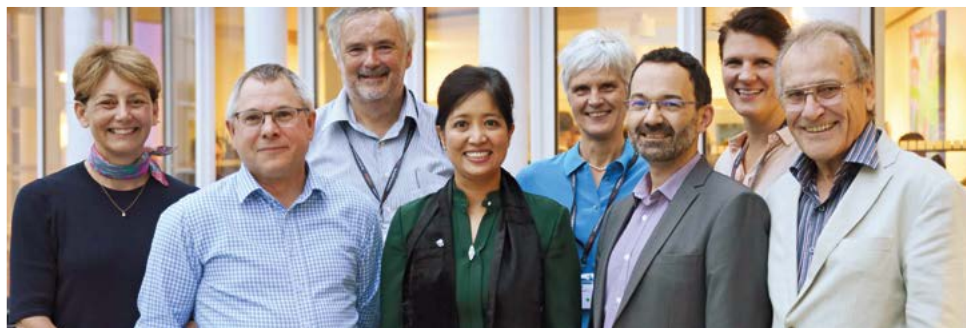
Impulse mentors 2017