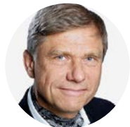
Dr Hermann Hauser