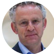
Prof Sir Richard Friend