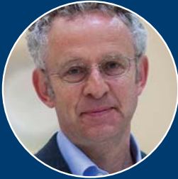
Prof Sir Richard Friend, Director of the Maxwell Centre

Impulse serves as a catalyst for entrepreneurship in individuals and organisations. The programme is about strong action learning and result driven where participants bring their innovative ideas to the table. It acts as a learning vehicle with a sharp focus on prioritising and developing “high-potential” business cases. The core of Impulse’s approach is to engage experienced entrepreneurs to act as role models and to provide guidance at the heart of the Cambridge Phenomenon.